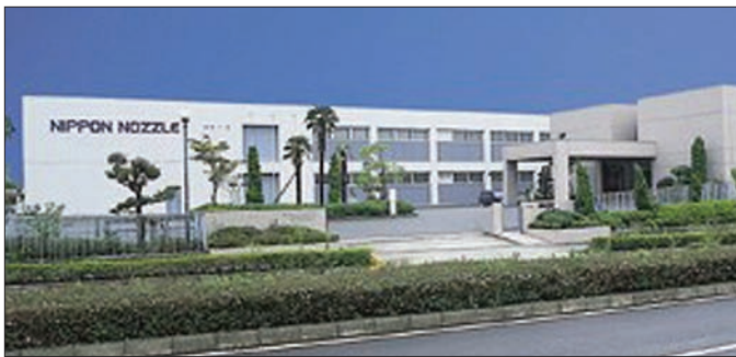
Nippon Nozzle's factory in Japan

In 1932 Nippon Nozzle of Japan produced the first commercial spinnerette for Japanese Rayon producers. Since then it has produced every type of thin plate spinnerette including spun lace jet strips. It is also a leading supplier of high quality melt spun spinnerettes. Outside of traditional textiles it produces precision parts for membranes, fuel injectors and sealing valves. Nippon Nozzle is a world leader for the production of very precise parts that incorporate extremely small holes. Nippon has produced holes as small as 16 microns.